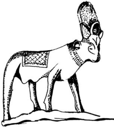
The golden calf was modelled on one of the Egyptian gods. This bronze Apis bull was found at Ashkelon in Israel

Ex.32 v 1 to 8 We see in this chapter that they soon forgot God. Despite various spectacular miracles, such as the parting of the Red Sea and the destruction of Pharaoh's army, within forty days they made a golden calf and called it their god.