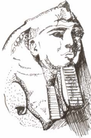
One of the Pharaohs