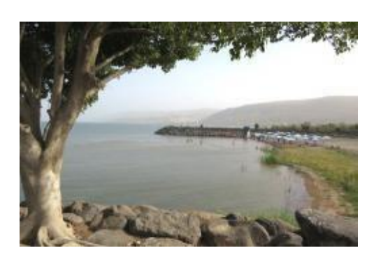
The Sea of Galilee where Jesus taught (v 1, see map).